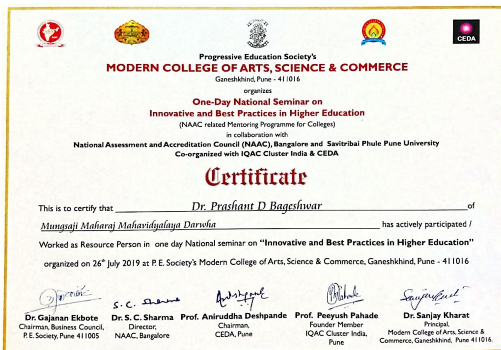
Certificate of active participation