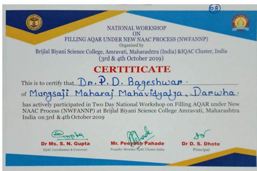
Certificate of active participation