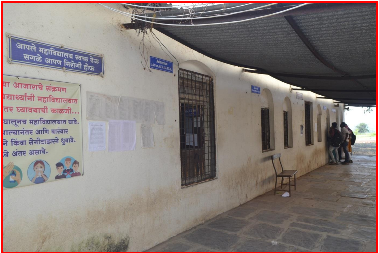
13) Students Window