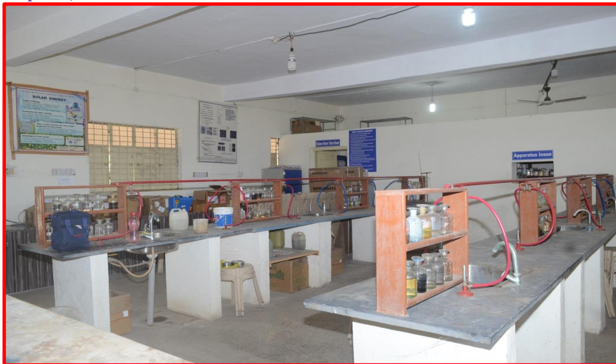
1) Chemistry Laboratory

4.4.2 There are established systems and procedures for maintaining and utilizing physical, academic and support facilities - laboratory, library, sports complex, computers, classrooms etc.