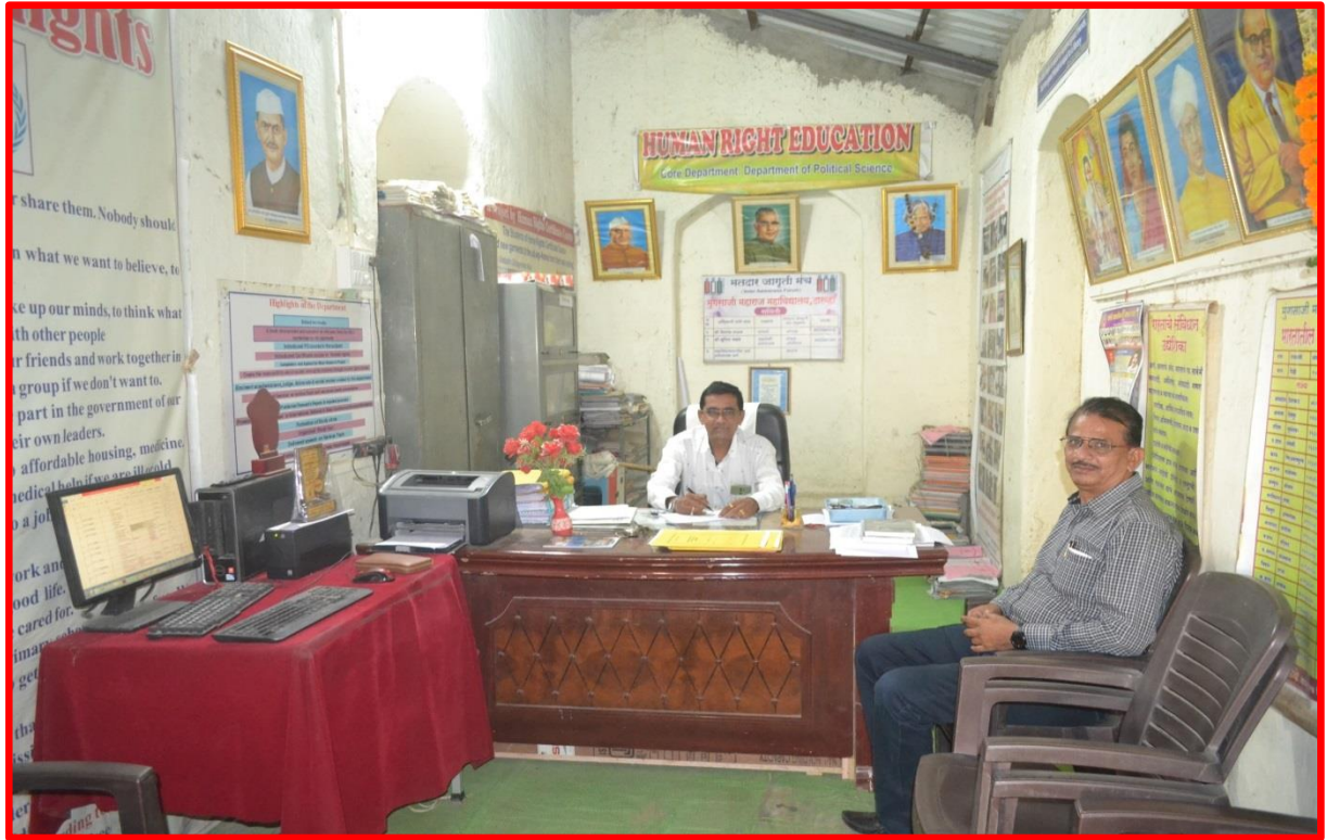
8) Department of Political Science