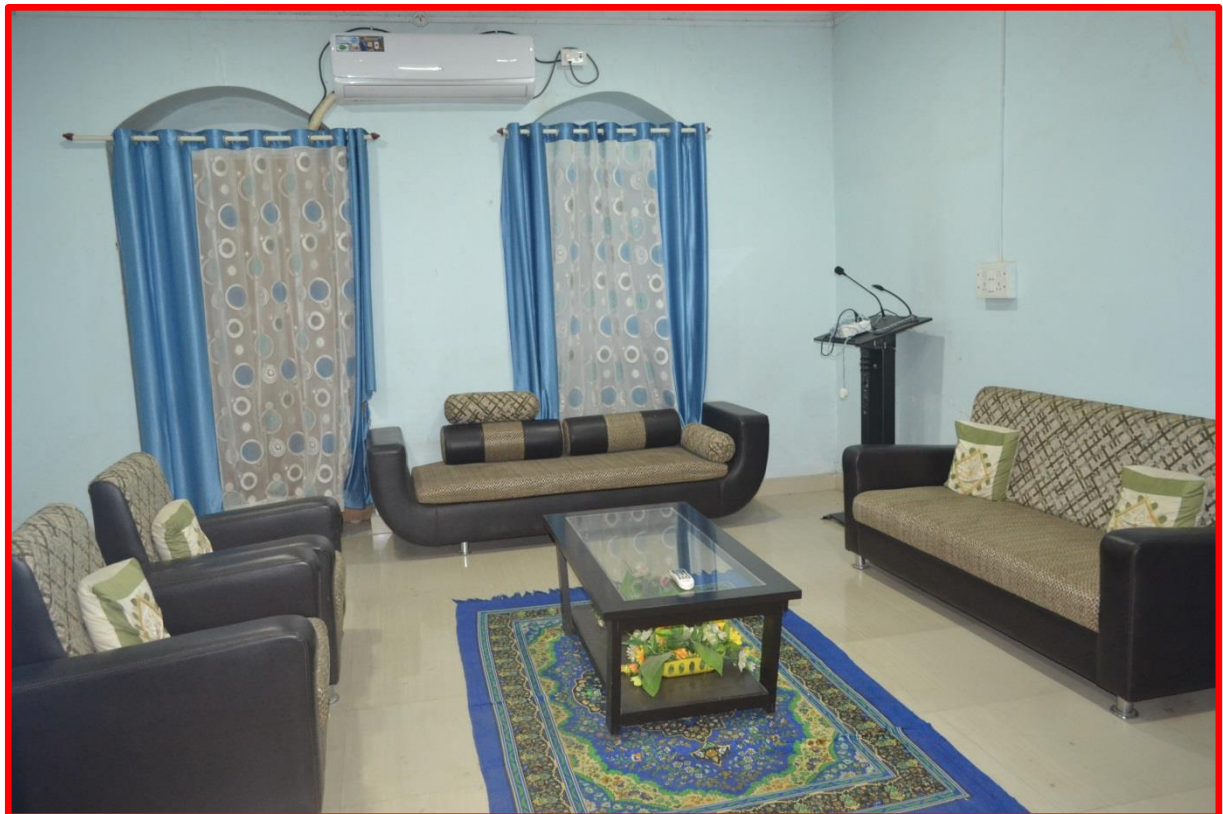
9) Management Cabin