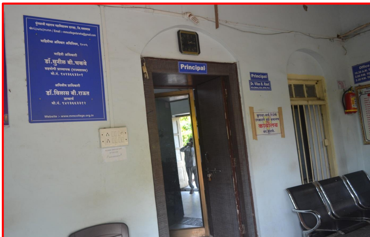
10) Principal Cabin