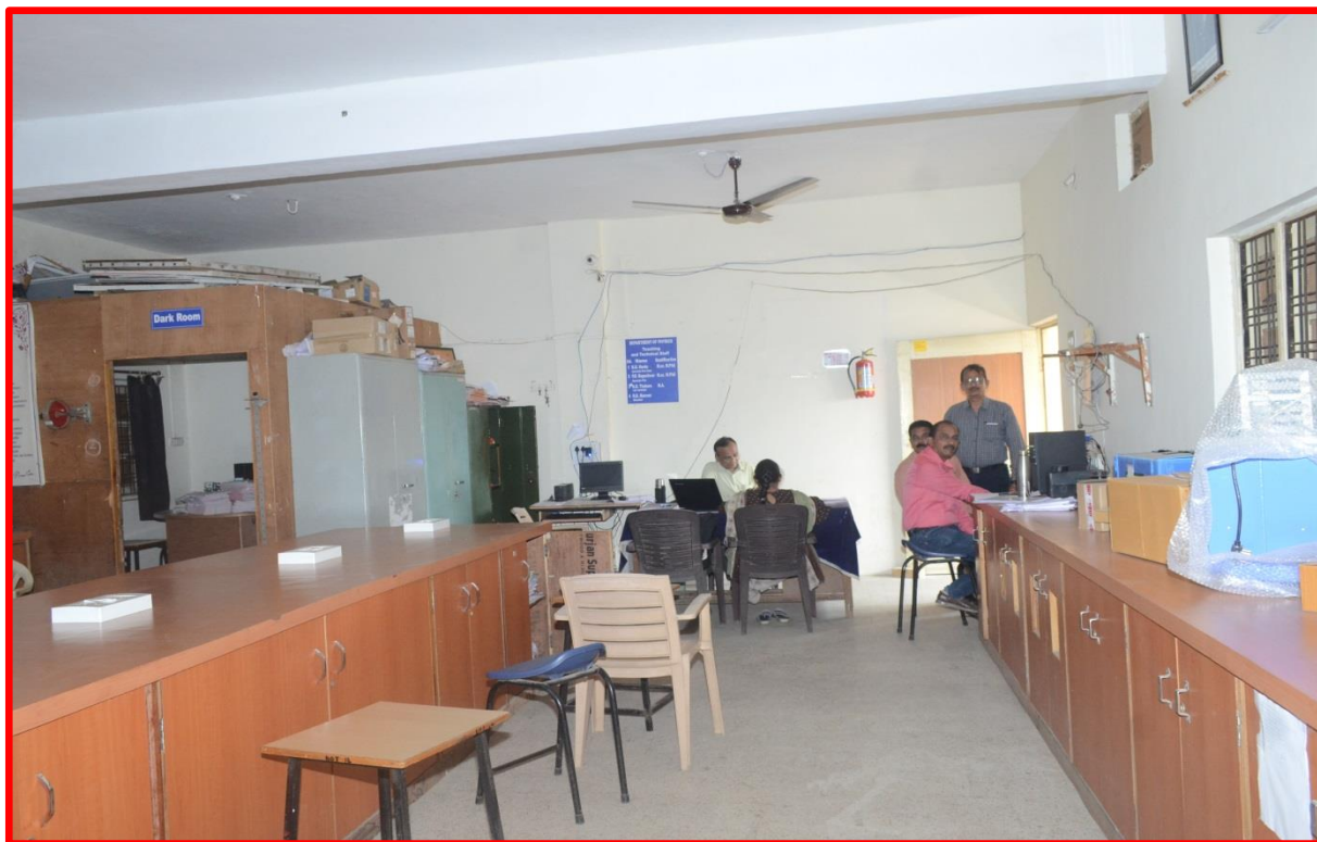
2) Physics Laboratory