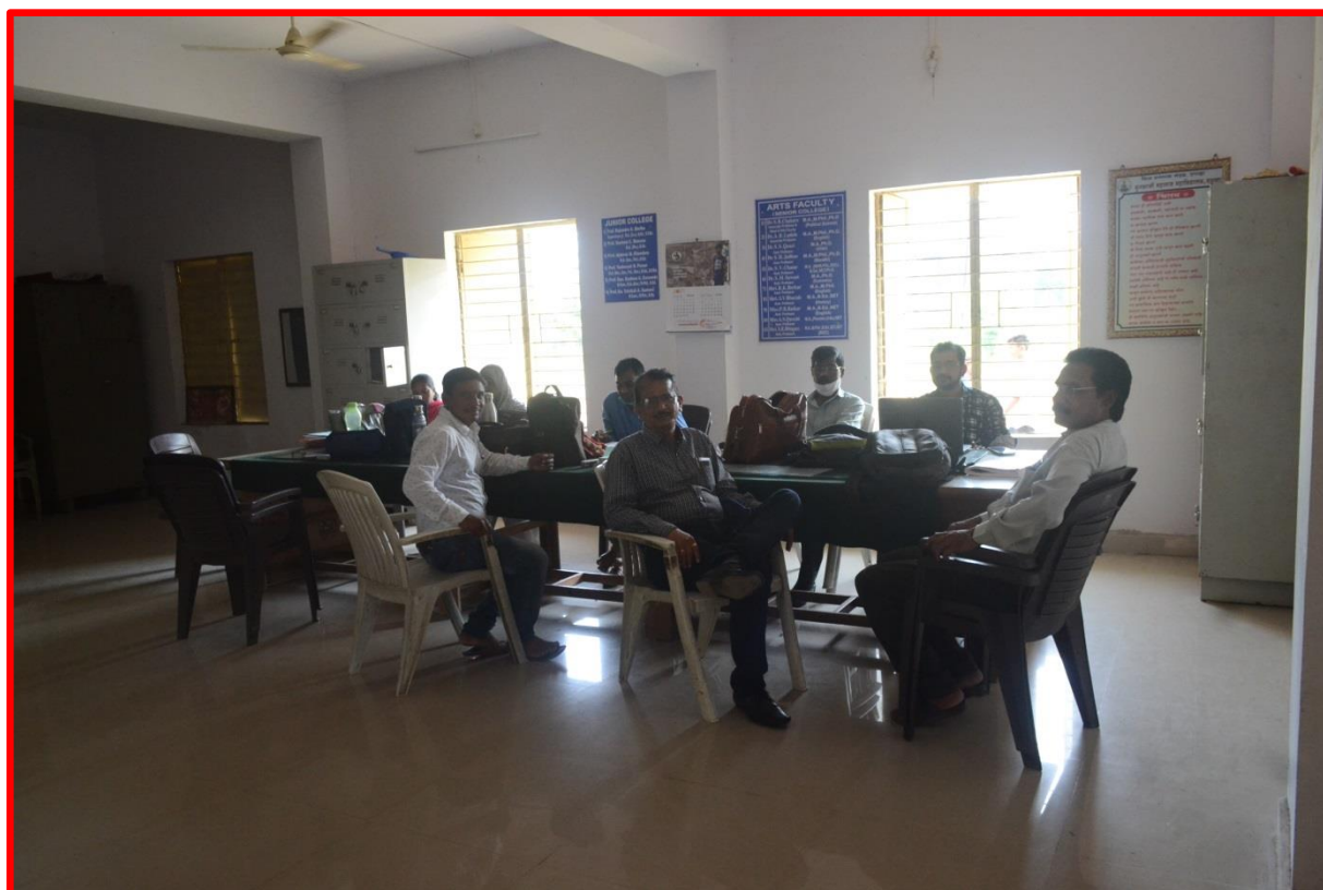
11) Staff Room