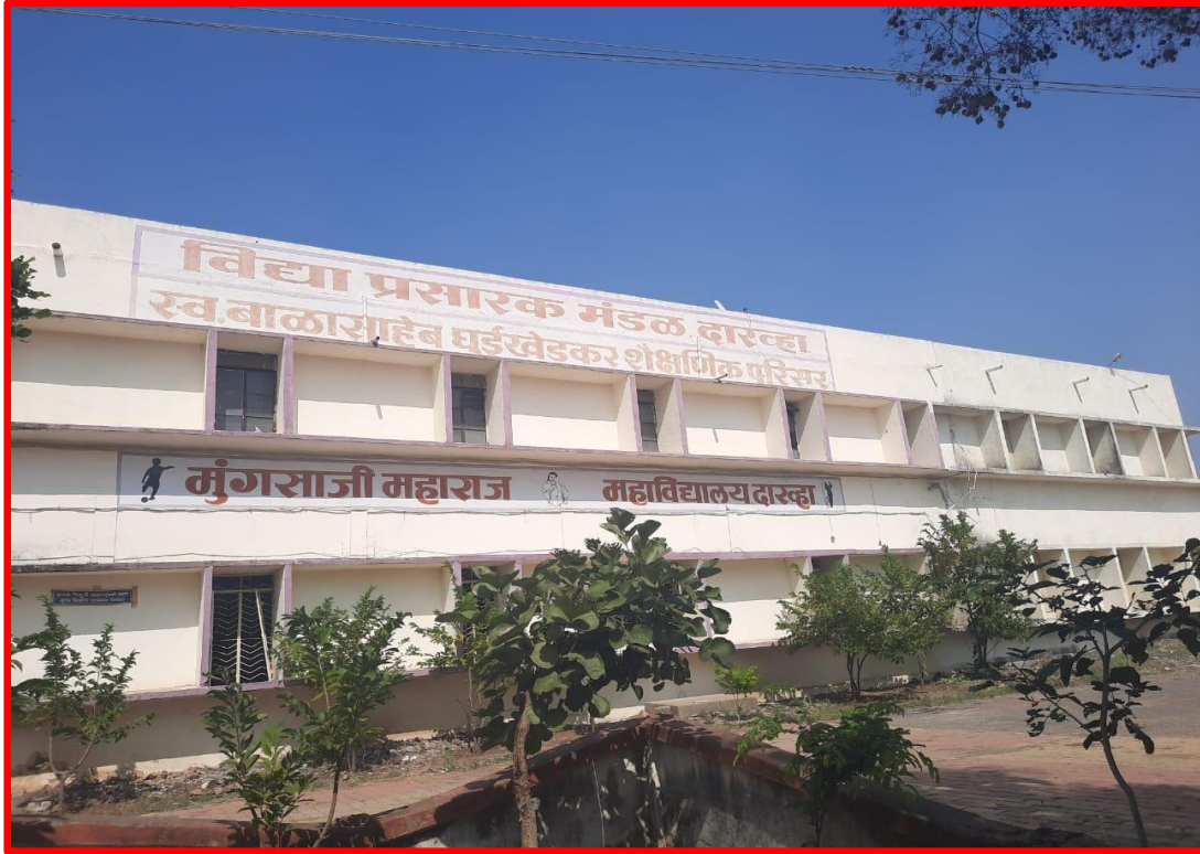
14) Campus View