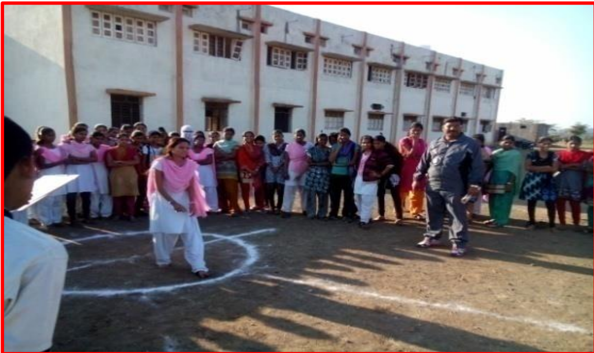
6) Play Ground