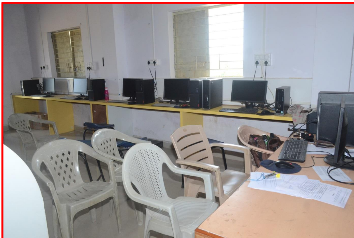
3) Computer Laboratory