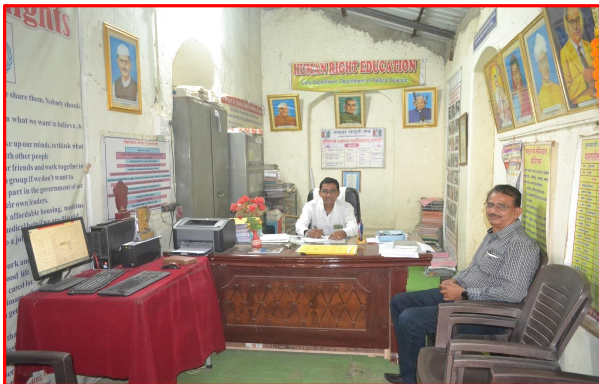
2) Department of Political Science