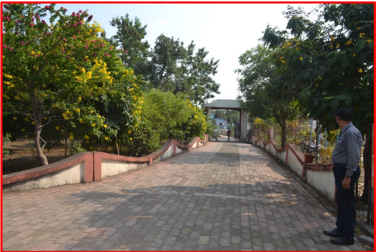
13) Campus Entrance