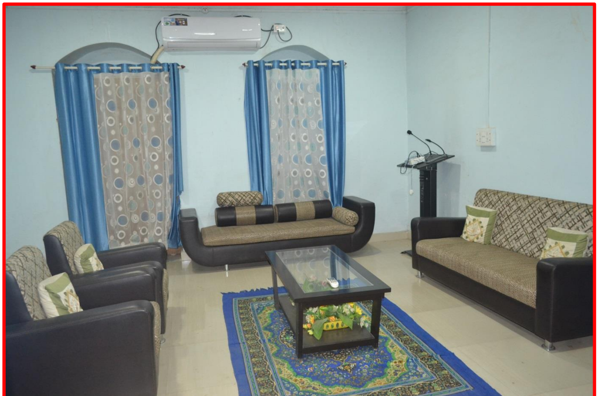
7) Management Cabin