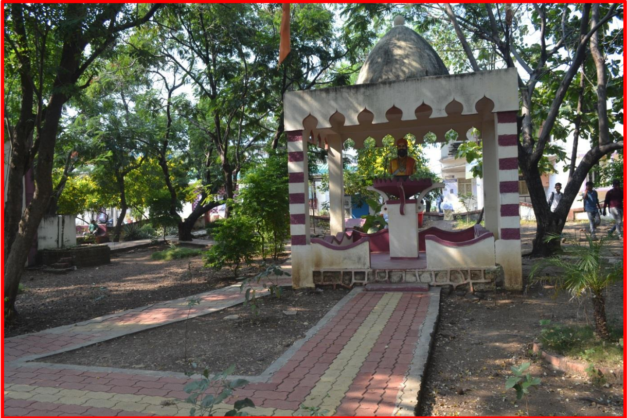
12) Garden View