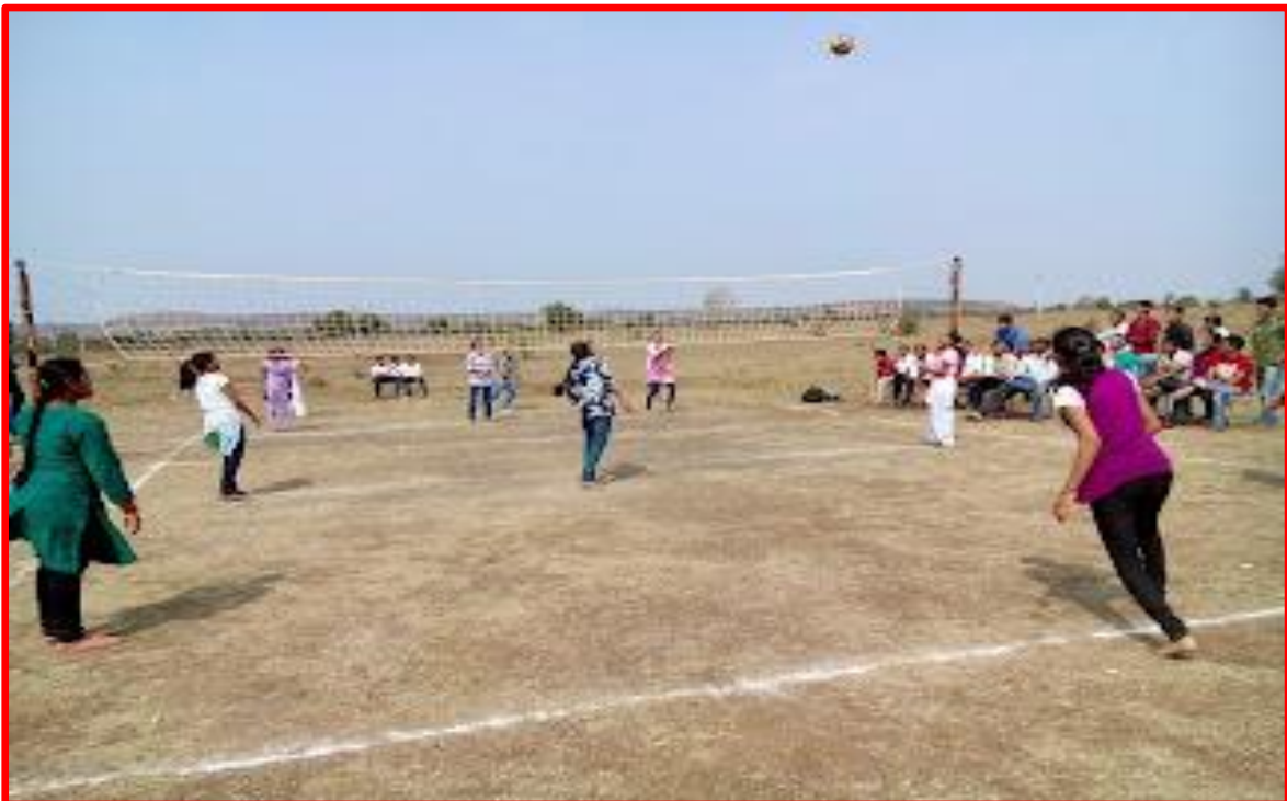
17) Play Ground