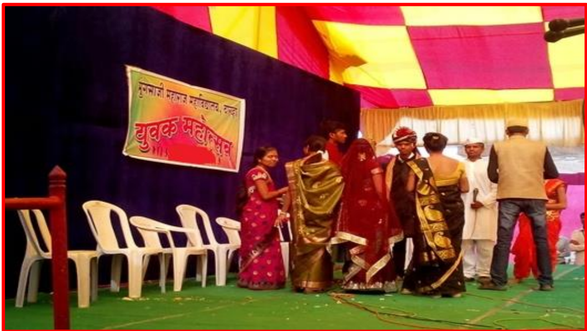
18) Cultural Activities