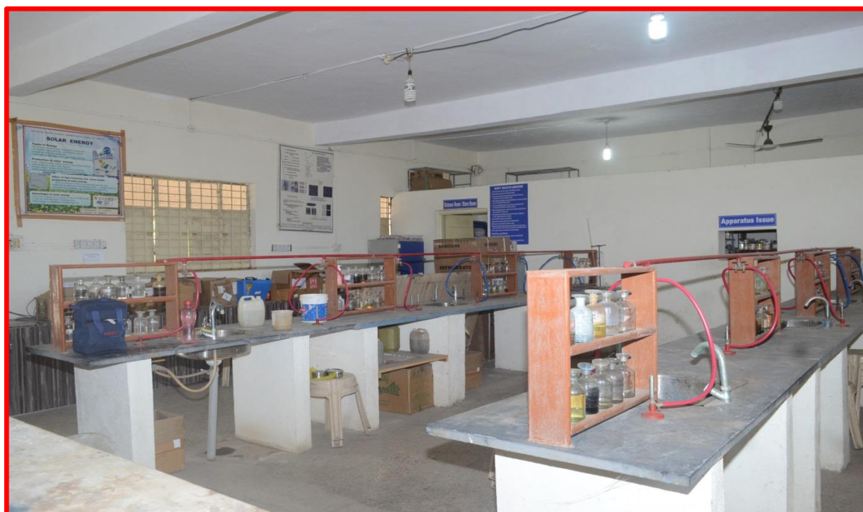
3) Chemistry Laboratory