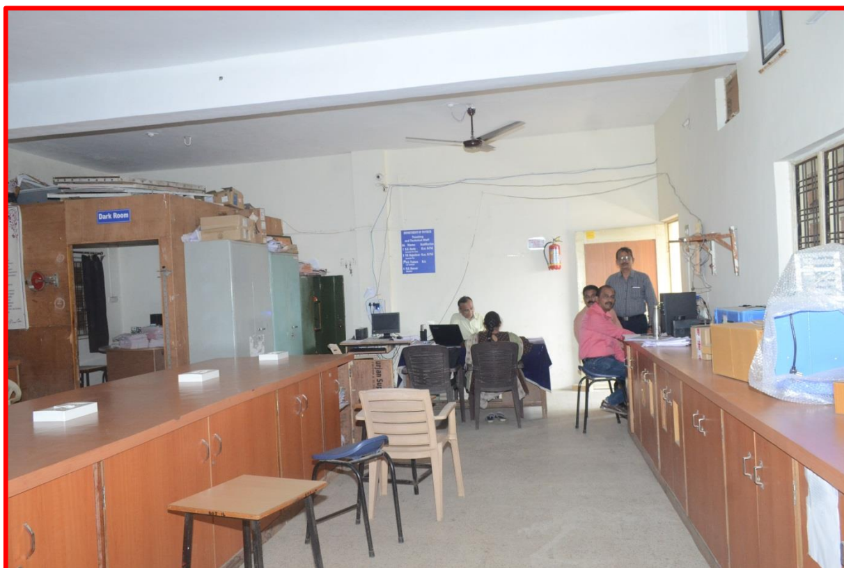
4) Physics Laboratory