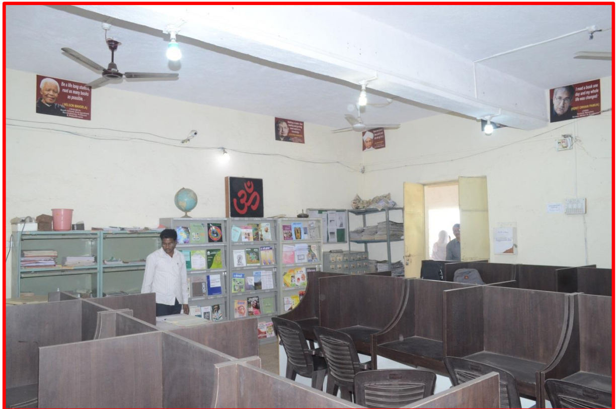
6) Reading Room