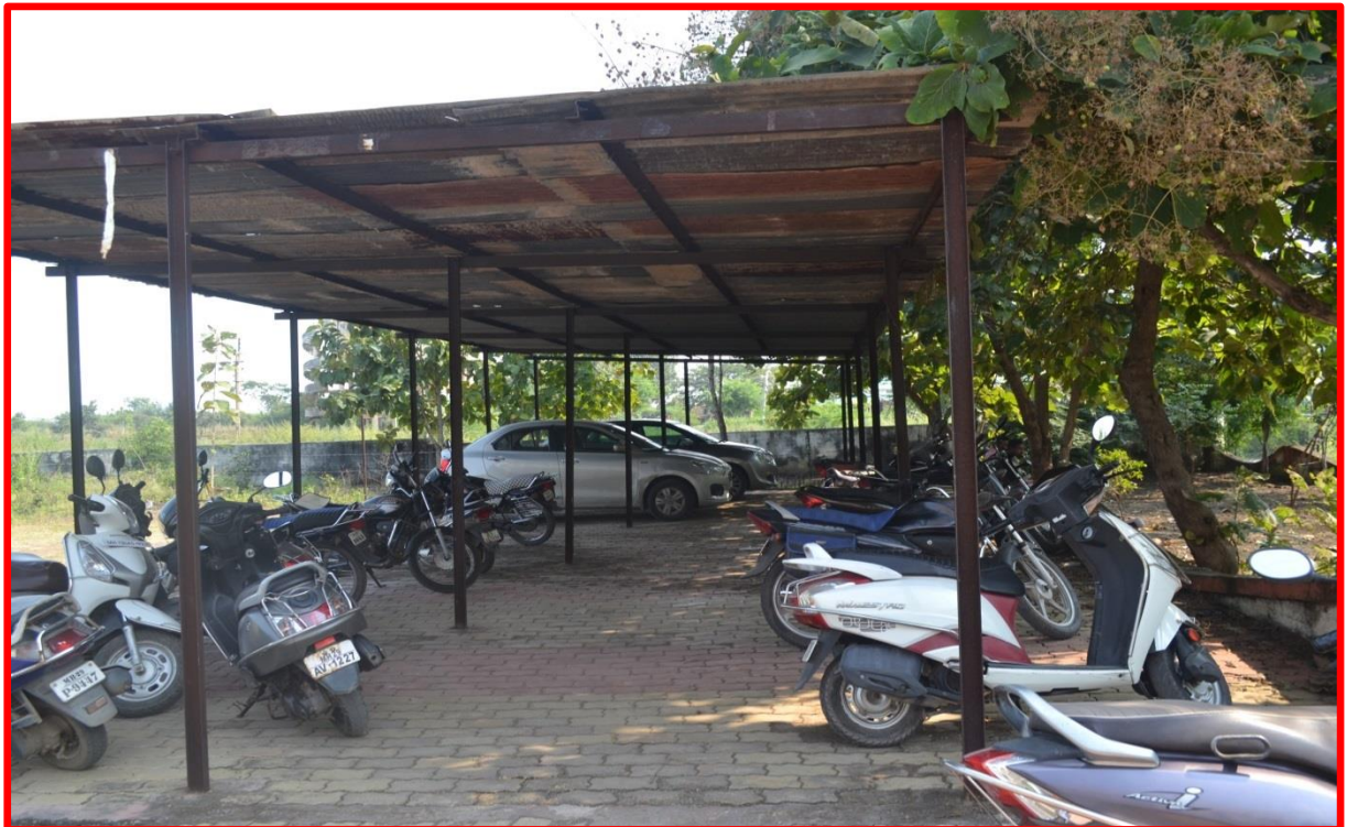
15) Staff Vehicle Stand