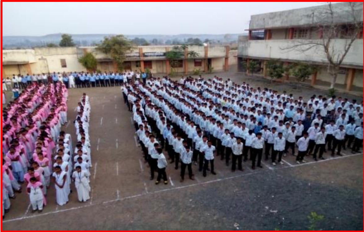
16) Daily Prayer