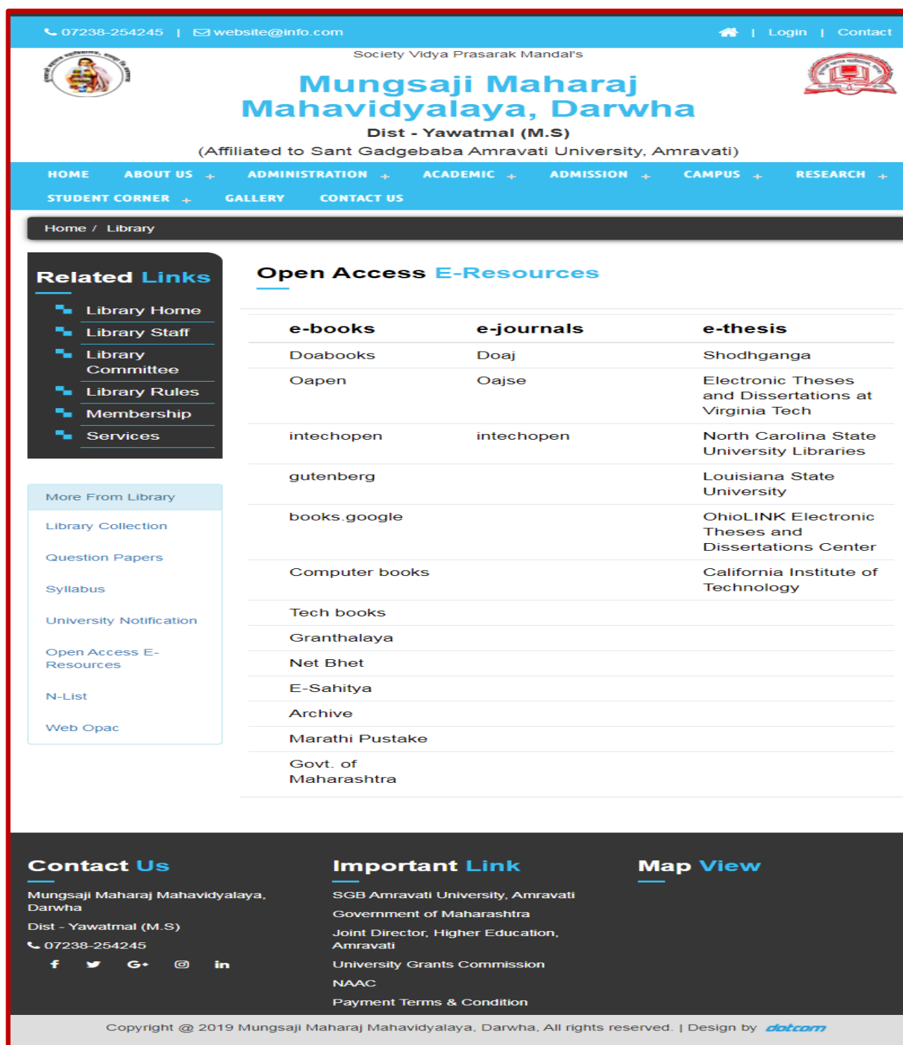
7) Screenshot of college library website for remote access to e- resources