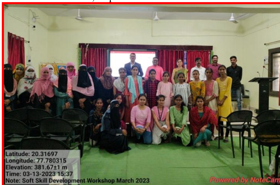
Group photo with expert trainer of soft skill development workshop