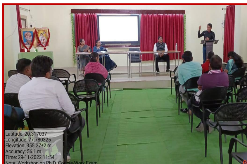
Photo copy of Workshop on 'Research Methodology'