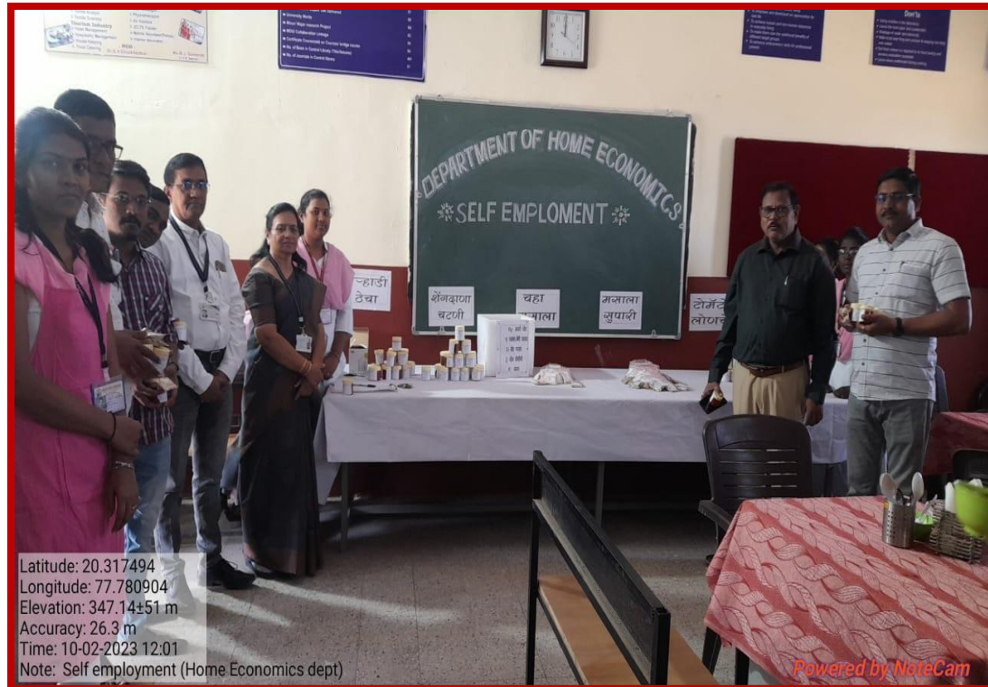
Photo copy of 'self employment workshop'