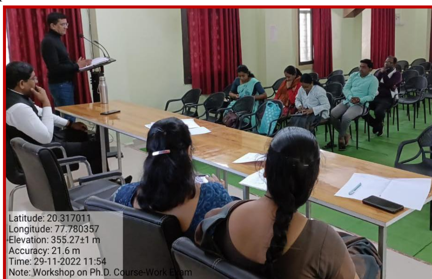
Photo copy of Workshop on 'Research Methodology'