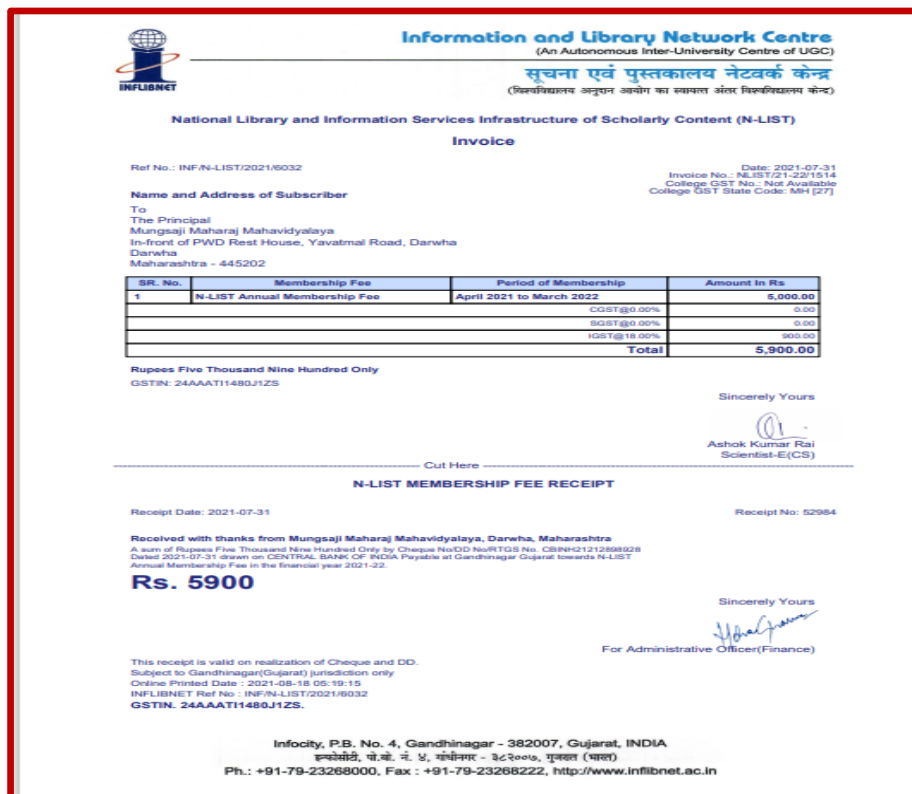
Receipt of N-list