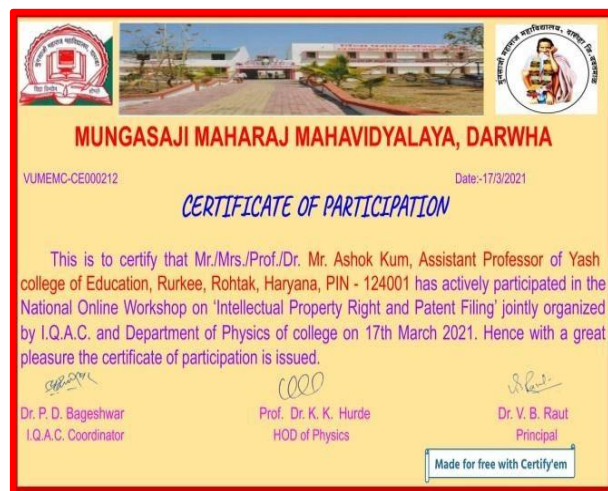
Certificate of IPR