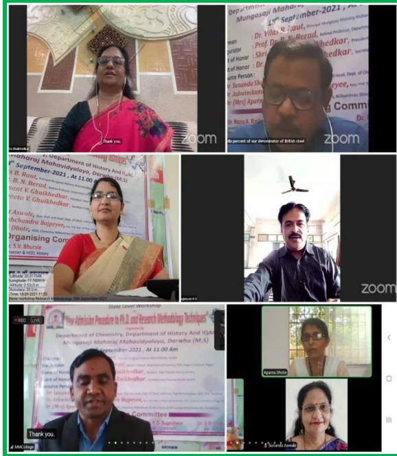
Screenshot of State Level Workshop