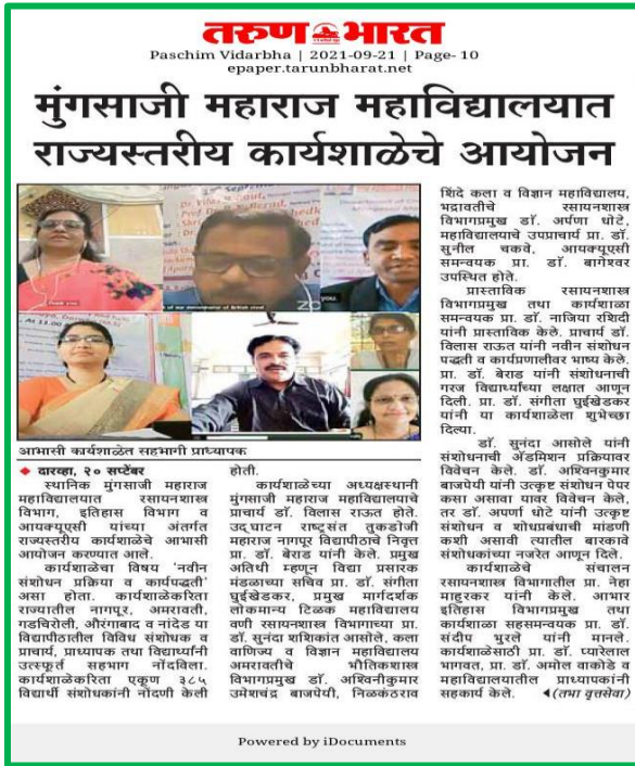
News of the state level workshop