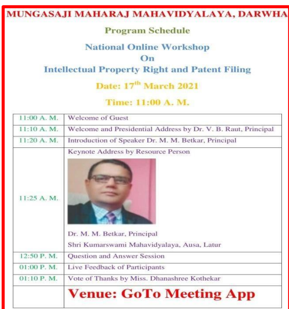
Programme Schedule of IPR