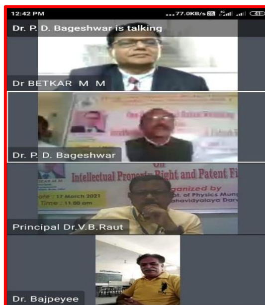
Screenshot of IPR