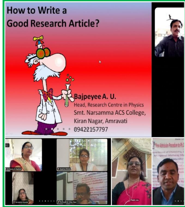
Screenshot of State Level Workshop