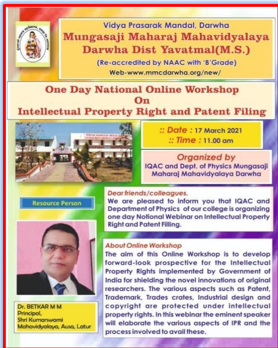
Brochure of IPR